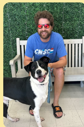
This is Barcode and his new best buddy, adopted after 329 days at Humane Society of Scott County!