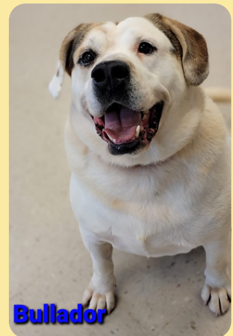
This happy face belongs to Bullador, who was the longest resident at the Quad Cities Animal Welfare Center, spending 705 days with them and just last week went to his forever home!