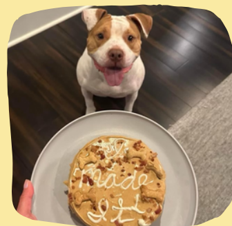
Here's Sugar Pie, another "Happy Tale" from Humane Society of Scott County!

There are so many wonderful homeless animals at all of our local animal shelters – some very young and some still young at heart. Some may look a bit different or have physical disabilities. But, if you’re thinking about adding a new furry family member, please check out all the great animals just waiting to brighten your day with their love. And remember, DON’T SHOP, ADOPT!